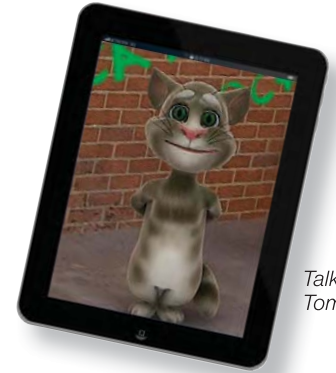
Talking Tom Cat

List of other suggested apps for children beginning to make sounds: